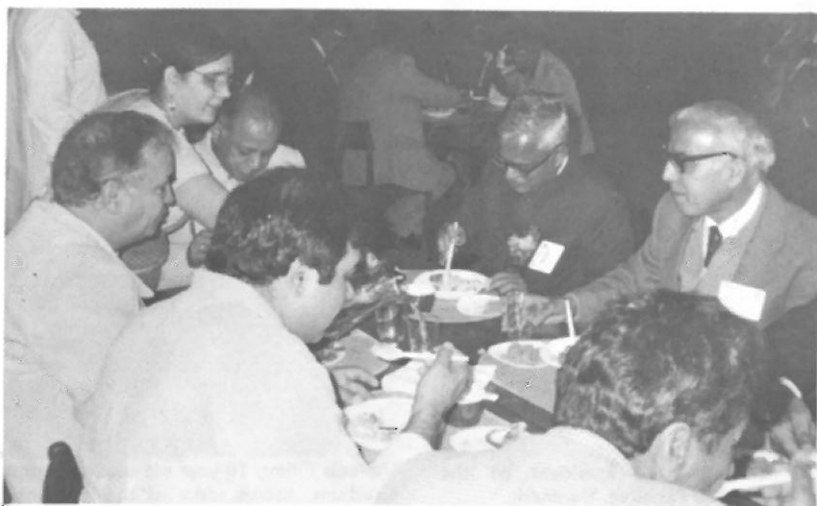
Photo taken at one of the luncheon sessions.

the participants and audience group sessions took place.