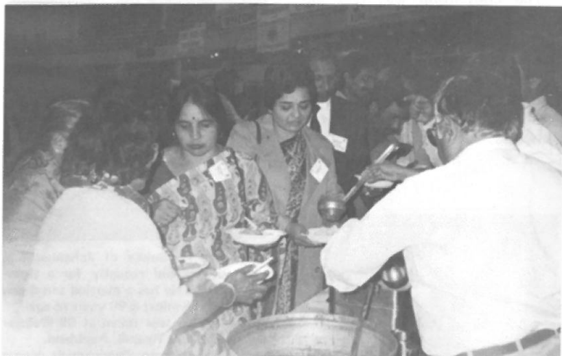
Volunteers from England and Germany prepared very delicious and wholesome food for three days of the convention.