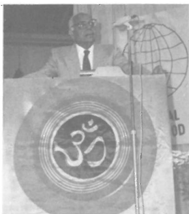
Mr. Ram Jethmalani speaking at the conference.